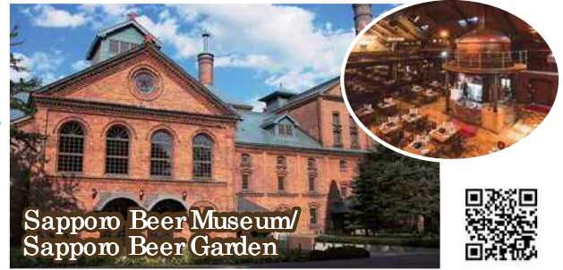
Sapporo Beer Museum/Sapporo Beer Garden

(Sapporo Sato-Land) Okadama-cho 584-2, Higashi-ku, Sapporo Tel: 011-787-0223