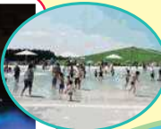
4 Moerenuma Park

Service 5% discount on purchases of 1,000 yen or more at the goods shop