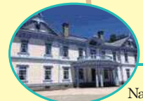
1 Hotel Mystays Premier Sapporo Park

Hotel Mystays Premier Sapporo Park Minami 9-jo Nishi 2-chome 2-10, Chuo-ku, Sapporo Tel: 011-512-3456