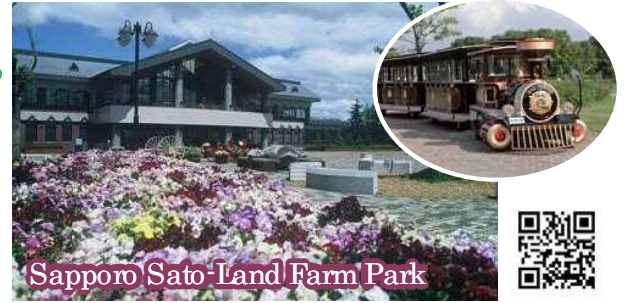
Sapporo Sato-Land Farm Park

(Moerenuma Park) Moerenumakoen 1-1, Higashi-ku, Sapporo Tel: 011-790-1231