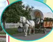
5 Sapporo Sato-Land Farm Park

Free service ● Bicycle rental (1 hour) ● SL Bus (once)