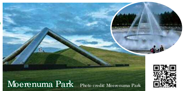
Moerenuma Park